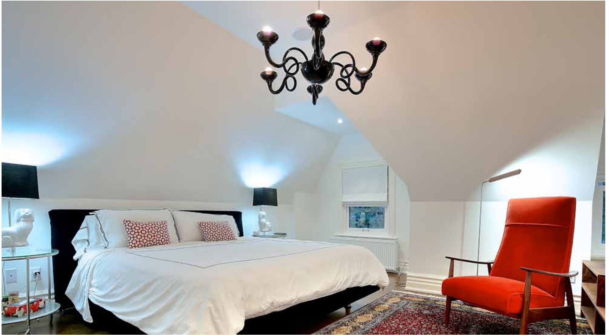
Sumptuous 3rd-Floor Master Retreat