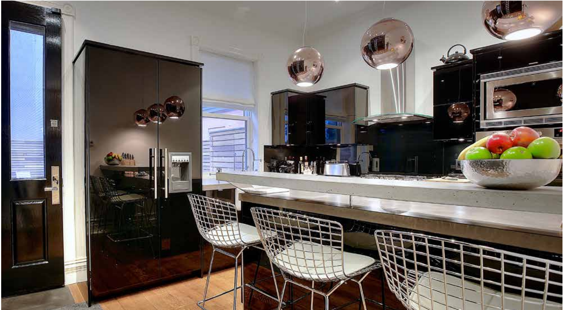
State of the Art Kitchen